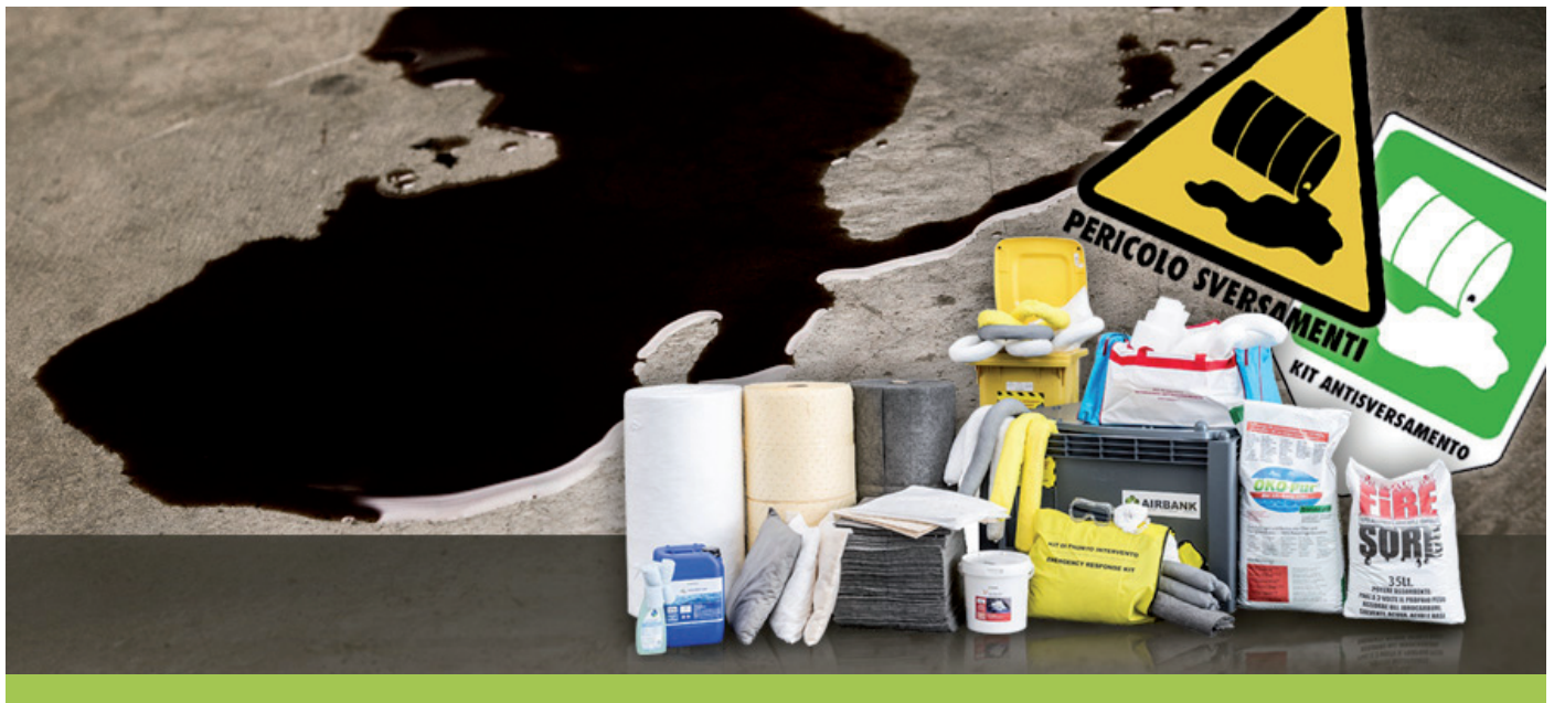
SPILLS EMERGENCY HERE ARE THE INSTRUMENTS TO INTERVENE IN A TIMELY MANNER

To ensure a rapid response in case of spills of dangerous and polluting substances, Airbank, a leading company in the field of pollution prevention and environmental safety, introduces signs and stickers to inform operators where to recover the rapid response kit in case of emergency and to indicate areas where there is a greater risk of accidental spills.