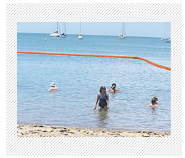
Rigid containment BOOMS with antijellyfish and seaweed...