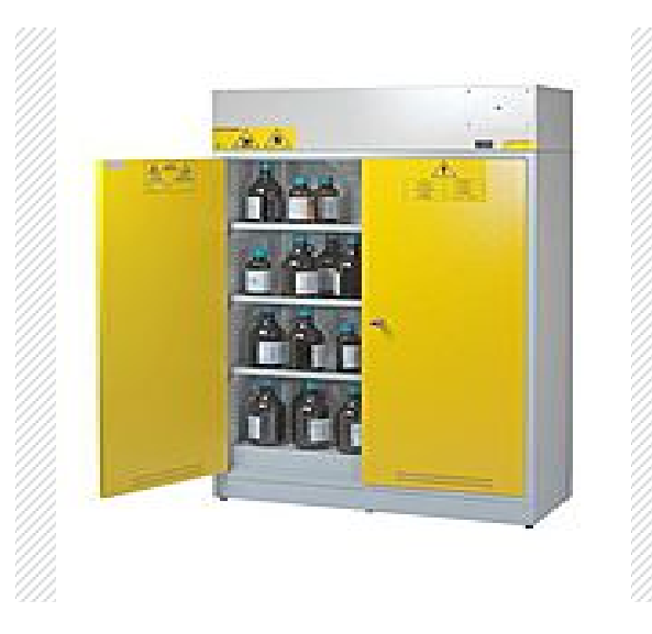
Safety cabinets certified for ACIDS, CHEMICALS...