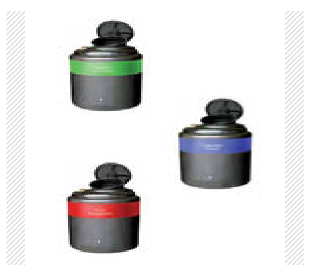
Collection container for liquid waste

"OIL ONLY 100% ECOLOGICAL" SERIES ABSORBENTS