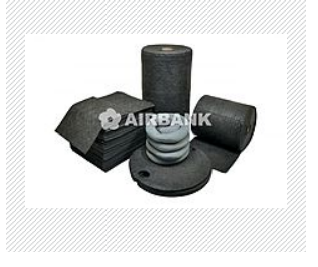
"UNIVERSAL 100% ECOLOGICAL"