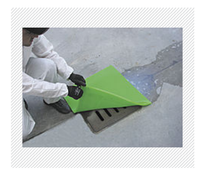
HIGH VISIBILITY DRAIN COVERS